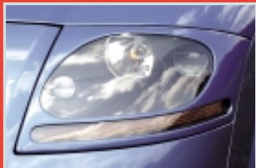
TYPE UHC.TT headlamp cover