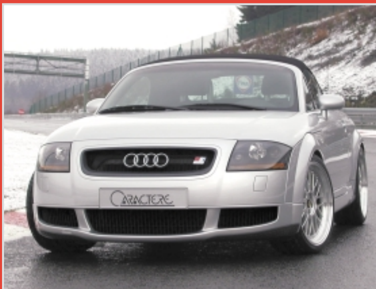
TYPE CL.TT front replacement lip spoiler with oversized air intake vents • TYPE CSG.TT 3-dimensional mesh sport grill with badge option