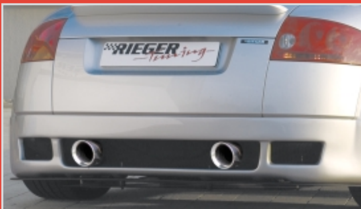
V2 rear splitter • Add-on exhaust valance, LLTEK tips

TT Rear Valance dilemma: Don't be fooled by their similarities, the lower and more aggressive RS Four lower valance is designed for huge exhaust tips. It can accommodate tips up to 120mm (4.75 in.) in diameter. The Classic rear valance is sporty yet elegant and can be fitted with tips or exhaust systems with tip diameters up to 90mm (3.5 in.). Both have a specific splitter option.