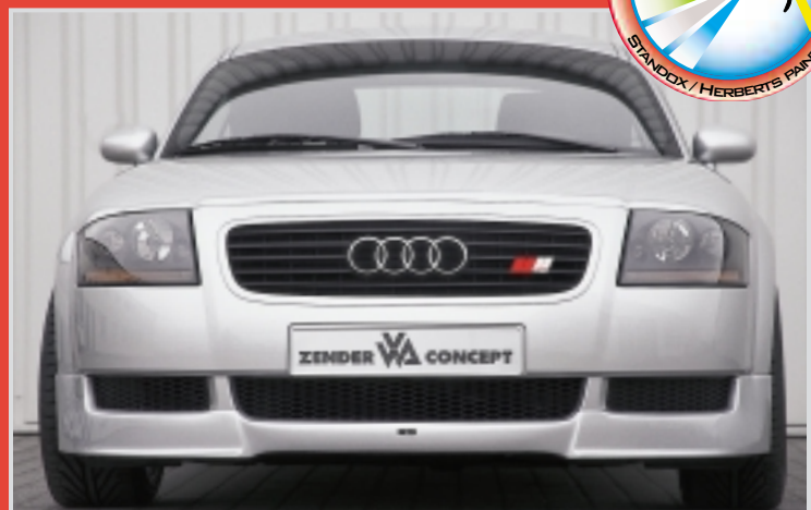
TYPE ZL.TT glue on lip spoiler creates technical styling.