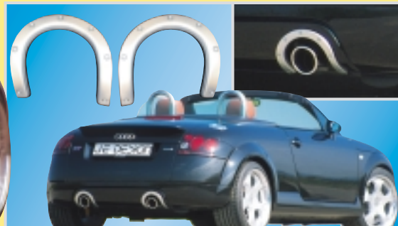
Exhaust frames on a TT 225