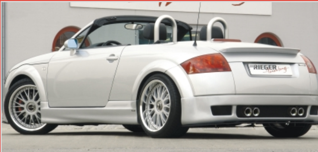
VI Classic Exhaust valance with quad tips