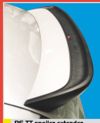
RS TT spoiler extender