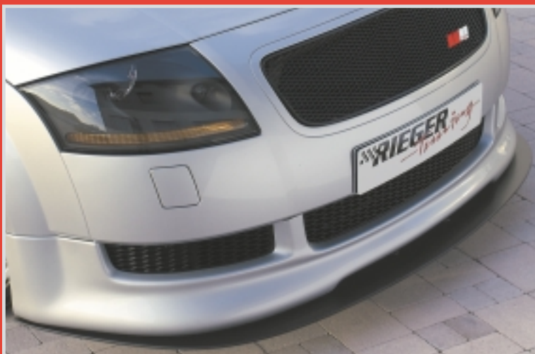
TYPE RFSI.TT black front splitter • JSG.TT mesh sport grill • VI model