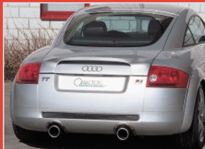
TYPE CE2.TT exhaust valence • TYPE CT.TT arch spoiler