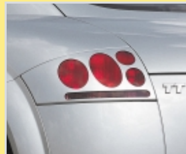
Dual glue on front lip spoilers and tail light mask match painted.