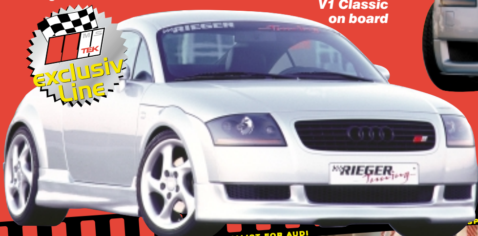
V1 Classic on board

New RS Four look for TT If you want enhanced air flow for extra performance then consider the new Rieger RS Four Look styling with 3 larger vent opennings. Because of the extremely large openings, components like high performance intercoolers and air intake systems perform with increased efficiency. Even without special hardware, this lower spoiler design will provide a modest gain in horsepower just because of the increased airflow, but a substantial gain in great looks! Also, consider the optional matched lower lip edge as well. Also available in mat black or optional custom paint color.