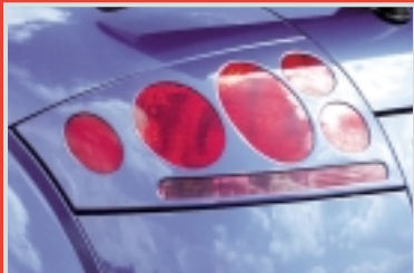
TYPE UTC.TT tail light cover