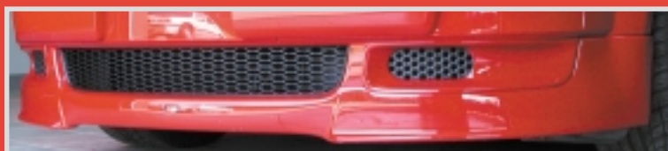
TYPE ZL.TT glue on lip spoiler with TYPE UAS.TT air scoops