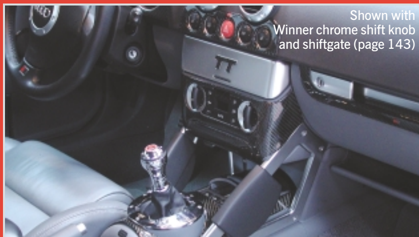
Shown with Winner chrome shift knob and shiftgate (page 143)