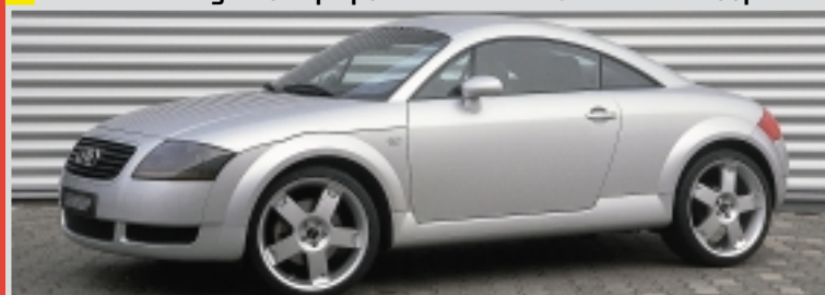
Zender TunerRad wheels on board