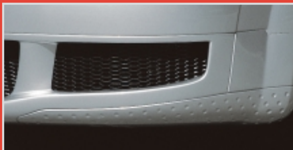
Exhaust frame included • TYPE CSG.TT 3-dimensional mesh sport grill with optional CARACTERE RS4 badge • Oversized air intake vent