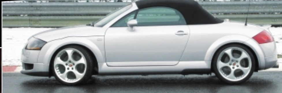
TYPE CDI.TT lower door insert kit • TYPE CSE.TT dimpled flush fitting side enhancer • P6000 wheels