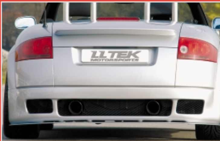
REV2.TT RS-Four exhaust valance allows for 120mm exhaust tips.