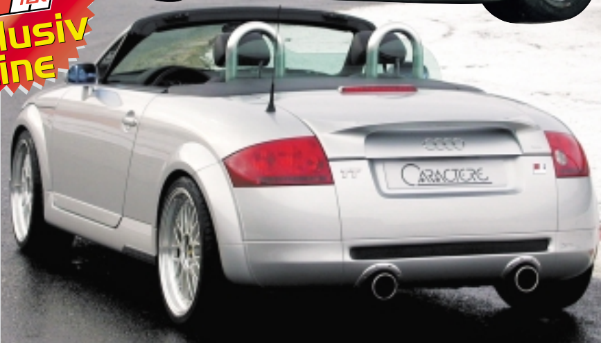
TYPE CT.TT arched trunk spoiler • TYPE CE2.TT exhaust lower valance (2 openings) • TYPE CDI.TT lower door insert kit