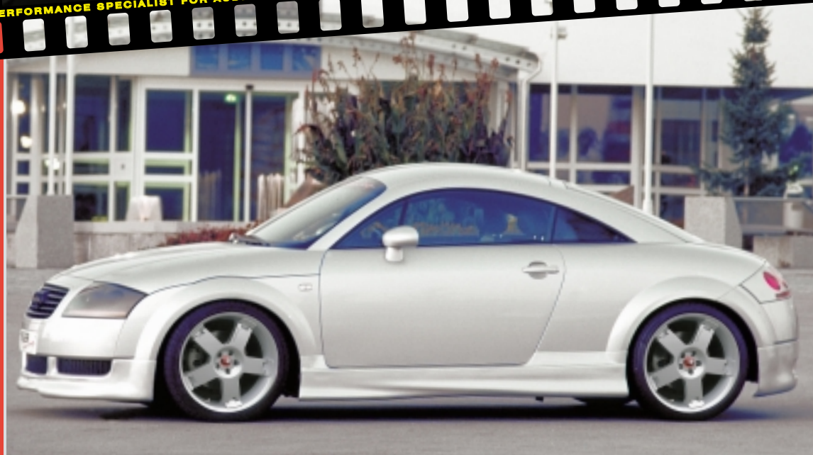
V1 Classic lip spoiler • Side skirts • REVI.TT exhaust valance • Tail light covers • Tuner Rad Wheels