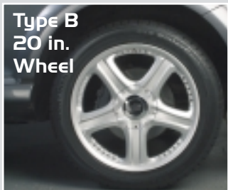
Type B 20 in. Wheel