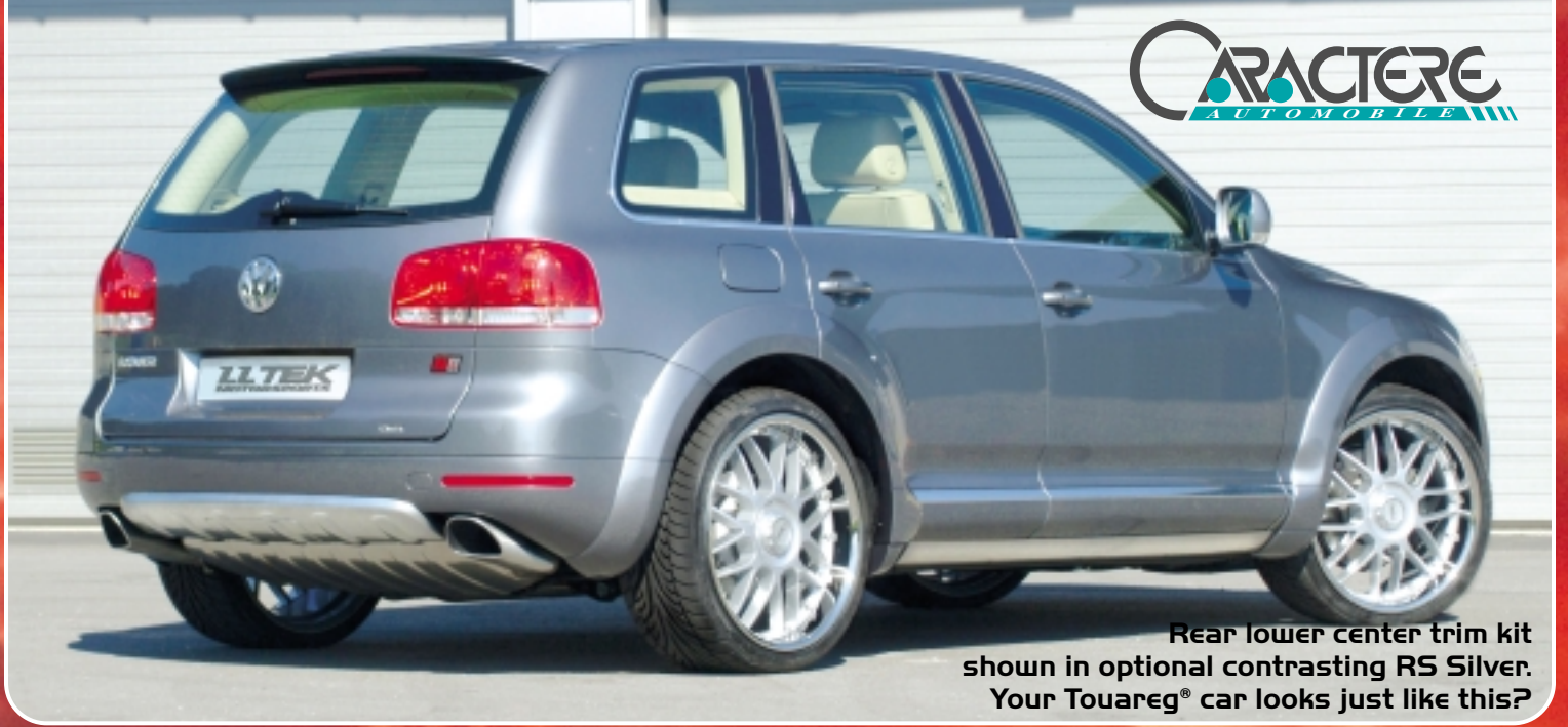
Rear lower center trim kit shown in optional contrasting RS Silver. Your Touareg® car looks just like this?