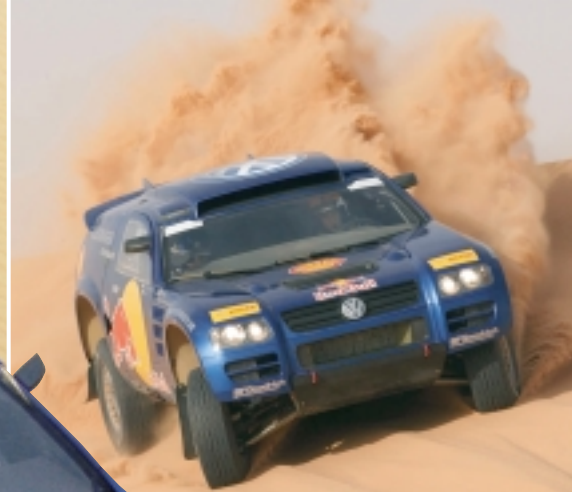
VW® Touareg® Paris-Dakar Rally contender kicking a little sand!

Some accessories on this page are not sold nor available through LLTEK Motorsports. VW® Touareg® Dakar pictures provided by VW Media Services. LLTEK Motorsports is not affiliated with Volkswagen AG of Germany nor Volkswagen of America Inc. in any way. Professional drivers, do not try this with your vehicle.