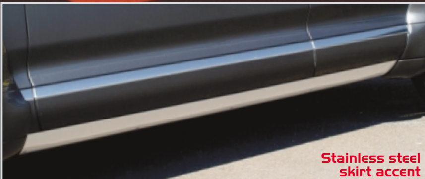
Stainless steel skirt accent

Call your friendly LLTEK representative for information and to order