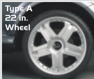
Type A 22 in. Wheel

This lightweight super strong alloy wheel with 5 spokes features an airy design to assist in brake cooling.