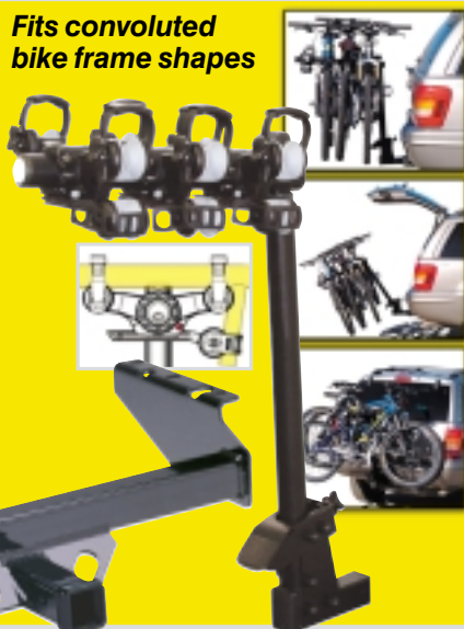
Class III hitch system

LLTEK offers a complete selection of heavy duty trailer hitches and hi-tech bicycle carriers to match the active lifestyle of many VW® Touareg® owners. Refer to the appropriate roof rack system, bike rack and trailer hitch section on page 41 of this catalog.