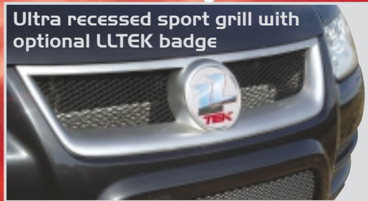
Ultra recessed sport grill with optional LLTEK badge

Direct from Europe, this exciting new styling package is perfectly executed. Once installed, your new version of the VW® Touareg® will set you apart. Take advantage of the package discount. A complete kit includes the front bumper accent, sport grill, wheel arches, stainless steel sides, roof spoiler, hatch blend and rear lower center trim (A-G). Make the transformation complete, do it all! To assist you, check out the schematic below.