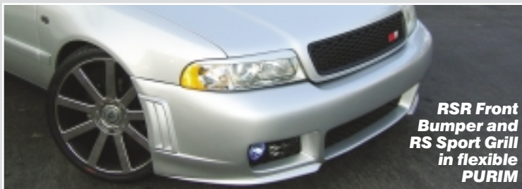
RSR Front Bumper and RS Sport Grill in flexible PURIM

When parts are ordered unpainted, you will receive them in the same condition as we do. Remember, the key to perfect looking paint is 45% in the preparation stage and 45% in the quality of paint and painter. The last 10% is in post painting (wax, polish, buffing). That's what the LLTEK paint team gives you, 100% all of the time when you order painted product.