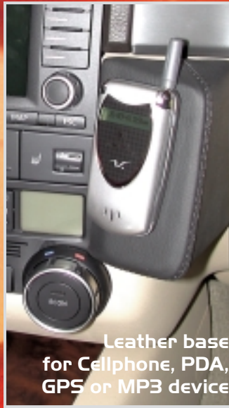
Leather base for Cellphone, PDA, GPS or MP3 device