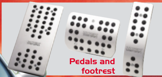
Pedals and footrest