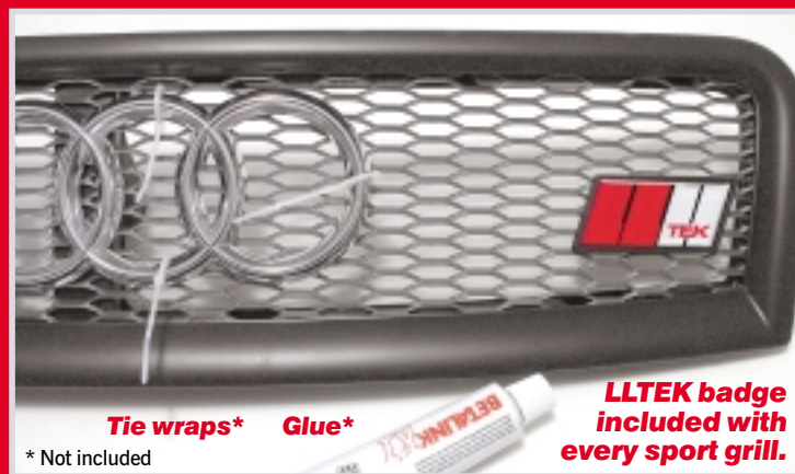
Tie wraps* Glue*