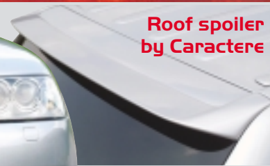
Roof spoiler by Caractere