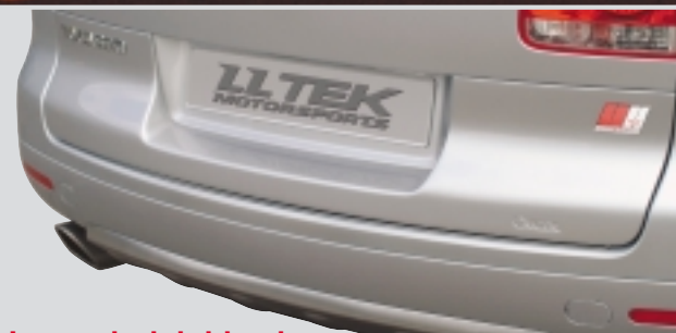
Lower hatch blend USA/CAN or Euro version available