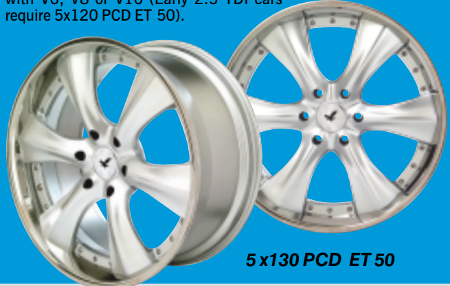
5x130 PCD ET 50

The Arrnage V-22 wheel for the Touareg® is 22" x 10". The stainless steel outer rim is deep dished plus highly polished. Valves are flush fit stainless. The 6 highly styled spokes are coated with New Titanium Paint. This mono block is studded for the 2 piece look. Styling is clean, elegant yet simple. The look is superior without being arrogant. There is sportiness in this luxury wheel. All Touareg® models with V6, V8 or V10 (Early 2.5 TDI cars require 5x120 PCD ET 50).