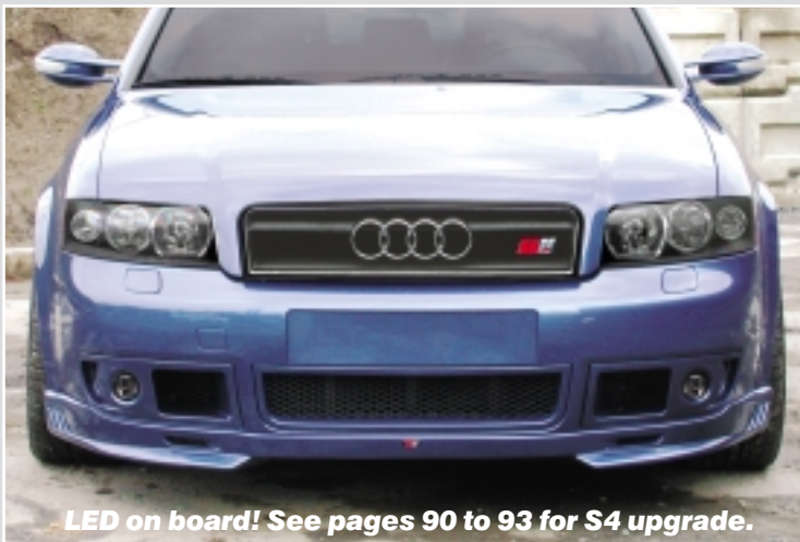
LED on board! See pages 90 to 93 for S4 upgrade.

assemblies ( LLTEK features 3 hot E code versions for the current A4 on page 55 and 119). LED headlight development is progressing quickly. A special A4 LED headlight is already used on Audi's ultra hi-performance DTM Race Car shown on several pages throughout the catalog. And look closely at the headlights in the UBERHAUS upgraded S4. Can you spot the LED headlights? Stay close to LLTEK for future developments and news on this exciting new technology.