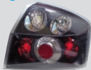
Krystal Black sculptured interior