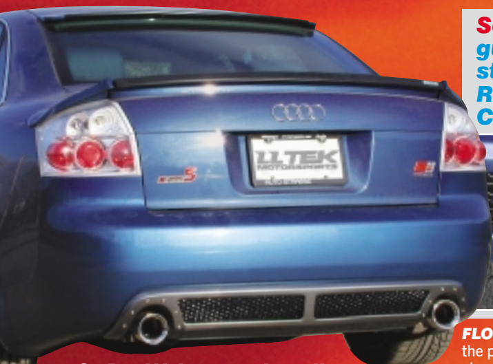
S4 Dual Valance on board!

Several rear valance styling options to better distinguish the true nature of the S4! Optional Stainless steel bolt styling, accent color in Titanium R paint or Retrolux Sport Mirrors with built-in turn signals. Call or visit WWW.LLTEK.COM for inspiration!