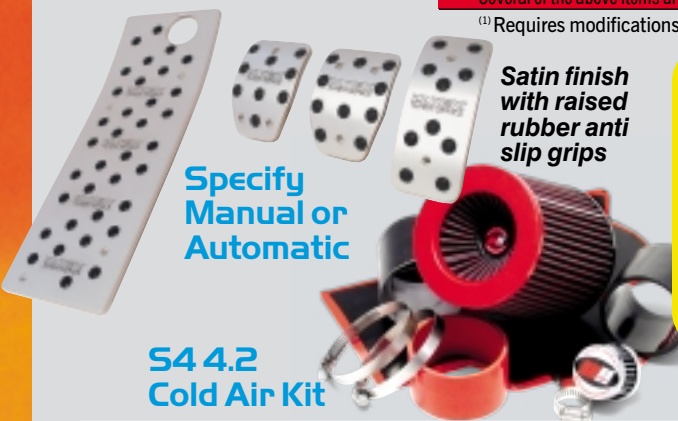
Specify Manual or Automatic