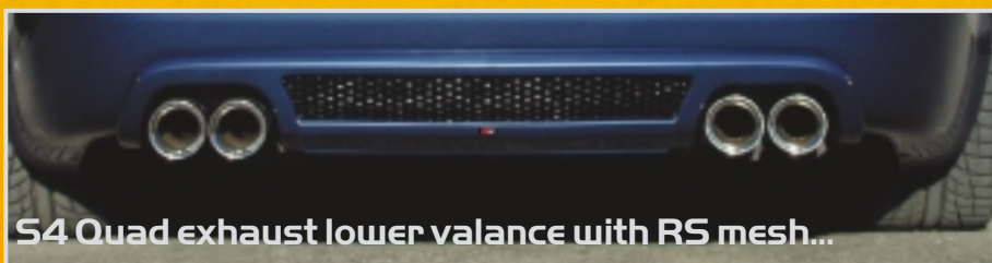
S4 Quad exhaust lower valance with RS mesh...