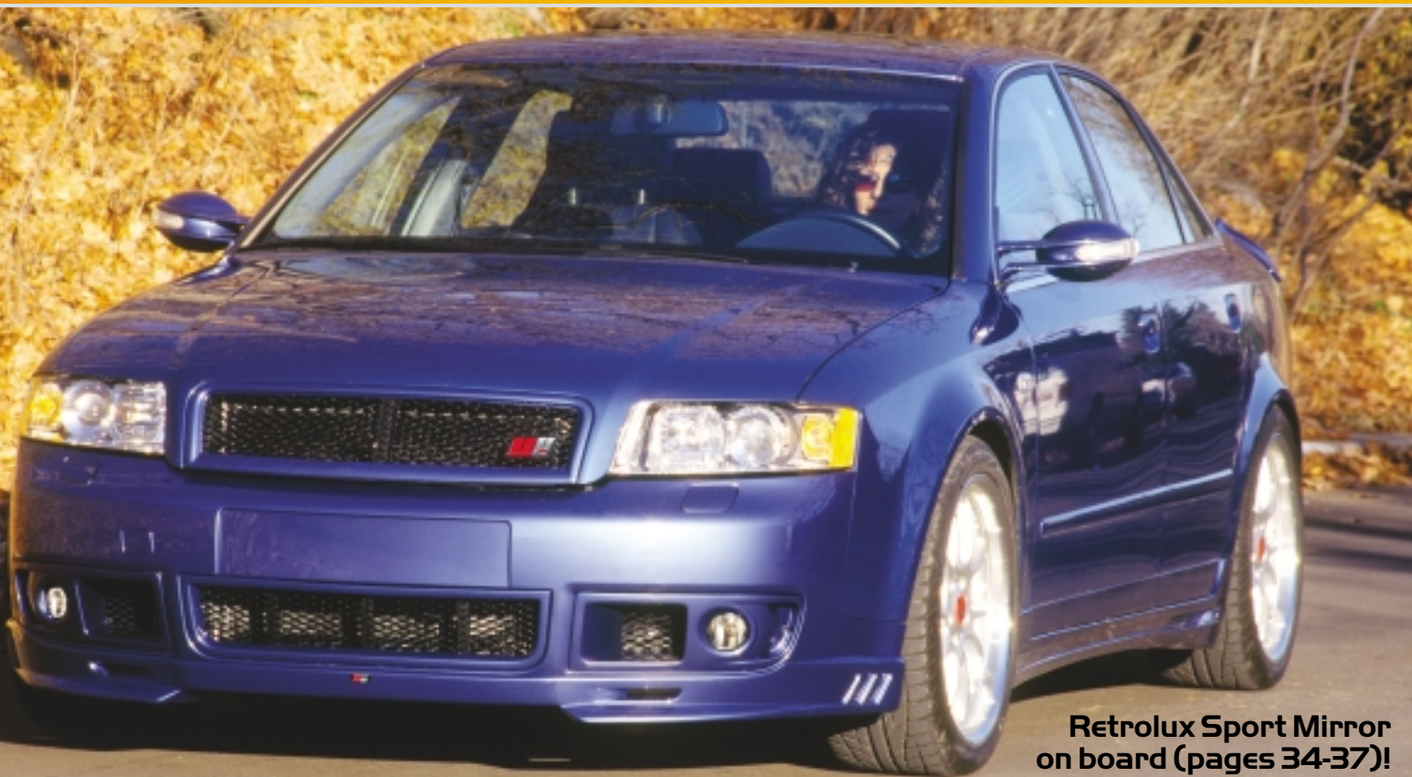
Retrolux Sport Mirror on board (pages 34-37)!

A udi has done a superb job with its new S4 SUPERCAR. This is no ordinary SUPERCAR. It is truly in a class by itself. Yet Audi designers chose to totally understyle the look of such a special car. In fact, at a glance you could easily mistake the mighty S4 for a regular 1.8T or 3.0 liter A4 variant. However, the LLTEK plan is to adjust all of that. Although the new S4 was recently released at time of printing, LLTEK stylists were already making plans to increase the car's visibility. Over time, these development plans will mature and grow. For now, LLTEK presents limited product and an outline of what it plans to make available for the new and powerful S4 in the way of styling emphasis and performance products. Of course, numerous A4 products already fit the S4 as certain parts are totally interchangeable. Suspension, exhaust, intake and other products are also being planned and will not be interchangeable with current A4 product.