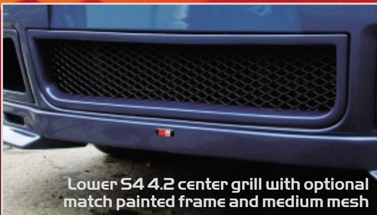
Lower S4 4.2 center grill with optional match painted frame and medium mesh