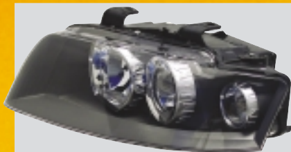
E-code headlamp • Black S4 interior • Extra large projector lens