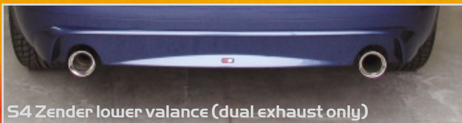
S4 Zender lower valance (dual exhaust only)

Several rear valance styling options to better distinguish the true nature of the S4! Optional Stainless steel bolt styling, accent color in Titanium R paint or Retrolux Sport Mirrors with built-in turn signals. Call or visit WWW.LLTEK.COM for inspiration!