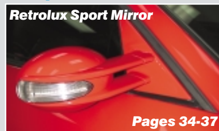
Retrolux Sport Mirror