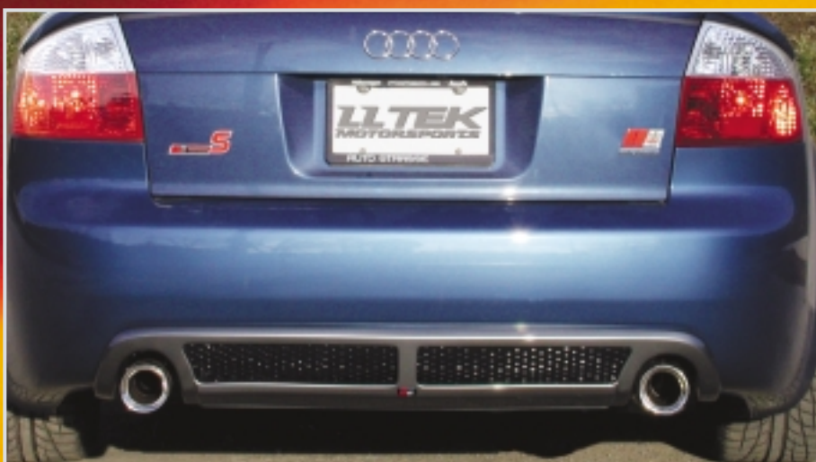
S4 Dual exhaust lower valance with RS mesh...

SIDE SKIRTS All side sills manufactured and designed for the A4 should easily fit on the S4. Therefore no Audi enthusiast need be denied this interesting styling product to create a true “hunkered down” look. Product is available in several different types of material covering Purim, ABS and composite.