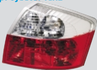
Krystal RS • S4 inspired